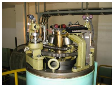
Figure 2. Overhauled PMG with Aux. Speed Switches