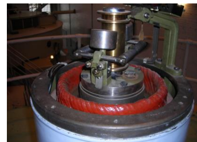
Figure 3. Remagnetized PMG

©2021 Emerson. All rights reserved. The Emerson logo is a trademark and service mark of Emerson Electric Co. Ovation™ is a mark of one of the Emerson Automation Solutions family of business units. All other marks are the property of their respective owners. The contents of this publication are presented for information purposes only, and while effort has been made to ensure their accuracy, they are not to be construed as warranties or guarantees, express or implied, regarding the products or services described herein or their use or applicability. All sales are governed by our terms and conditions, which are available on request. We reserve the right to modify or improve the designs or specifications of our products at any time without notice.