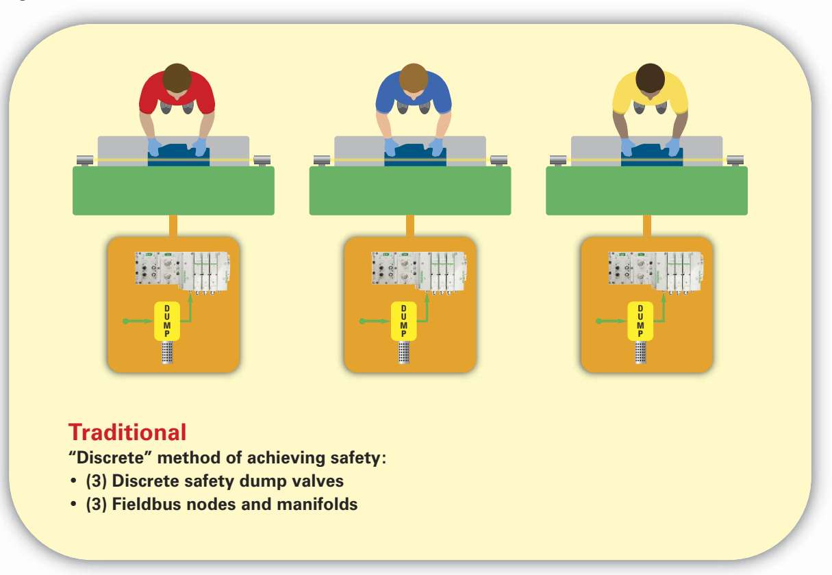
Figure 1: Traditional Method

To meet this requirement, equipment designers have typically employed redundant safety dump valves and other complementary products at each operation. These components implement the safety circuitry that shuts off the pneumatic system's air supply, dumps the air, and disables the operation. This solution can add significant complexity to machine design, manufacture, and installation. Also worth noting, when used in a continuous cycle fashion as identified below (figure 1), a redundant dump valve's life cycle capability may not allow the user to achieve the required PL level. Additionally, employing a redundant safety dump valve at each operation to meet the ISO 13849-1 standard adds unnecessary cost.