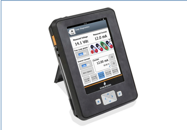
The rugged form factor is built for an industrial environment.