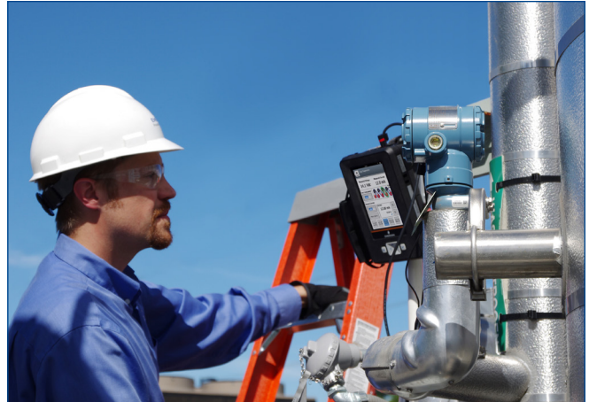
The magnetic hanger accessory allows you to attach the Trex unit to a pipe, freeing up your hands for other work.

You can also verify whether the DC voltage is correct in HART loops.