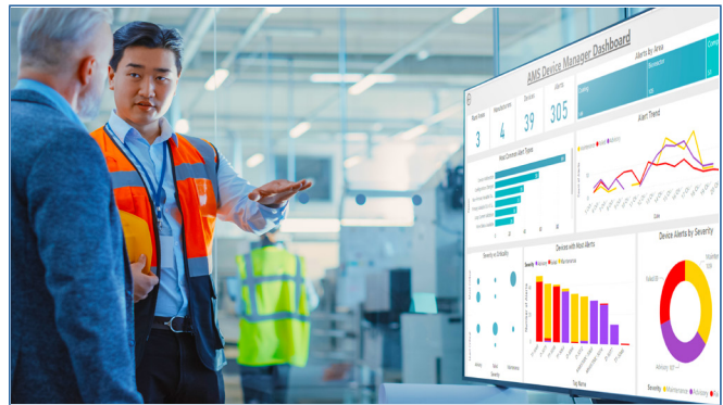
Microsoft PowerBI KPI and Analytics dashboard displaying smart device data via AMS Device Manager Data Server capability.

AMS Device Manager Data Server provides necessary valve data to enable the Plantweb Insight Valve Health app. This simplifies and expedites evaluation of the overall status of the valve fleet, allowing non-specialists in control valves to understand fleet health and prioritize repairs based on easy-to-understand, actionable information.