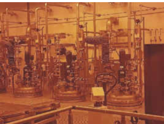
All actions carried out in the course of the order are fully tracked and combined in the manufacturing batch record

bottle produced in conjunction with SAP. All actions carried out in the course of the order are fully tracked and combined in the manufacturing batch record (BR). The BR automatically collects all manufacturing data and information as designed in the recipe as well as any comments or attachments, which can be