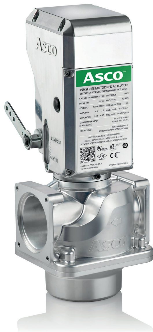
Figure 3. Emerson's ASCOTM Series 158/159 are engineered to support higher flow rates and performance longevity. These safety shut-off valves can replace pneumatic operation with electrical actuation, which can improve energy efficiency.