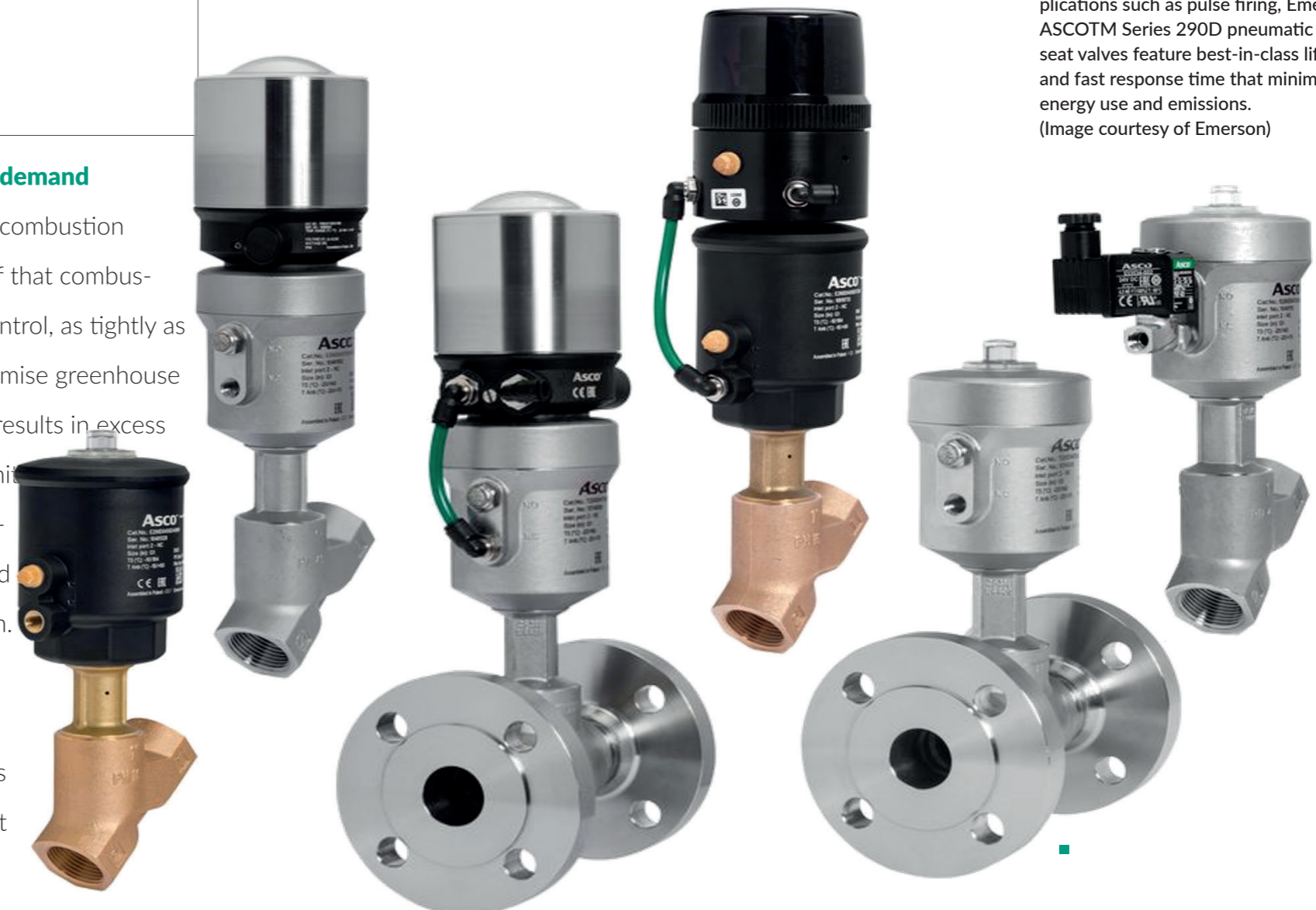
Figure 2. Designed for high cycling applications such as pulse firing, Emerson's ASCOTM Series 290D pneumatic angle seat valves feature best-in-class lifetime and fast response time that minimizes energy use and emissions.

approaches not only makes good environmental sense and helps control costs, but it can also help facilities comply with increasing regulatory requirements. There are local laws and regulations in multiple countries that define maximum nitrous oxide levels in parts per million, depending on equipment type and size. Taking steps to optimise the air/fuel ratio can provide one strategy to help facilities comply.