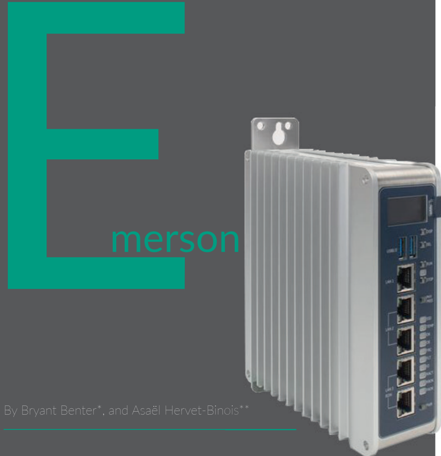
Figure 4. Left: To improve sustainability in combustion processes, PACs like Emerson's PACSystems RX3i CPL410 Controller, configured as powerful and flexible edge controllers, can support more sophisticated pulse firing processes, as well as collect, analyze and transmit data to higher-level management and analytical systems.

By Bryant Benter*, and Asaël Hervet-Binois**