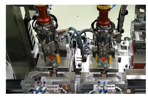
Interchangeable chucks handle different types of lids.

"7-axis portal system reduced errors in sealing and significantly improved operational throughput"