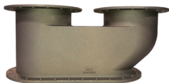
Oblong-shaped Adapter Custom-designed to fit oblong openings of dead weight hatches