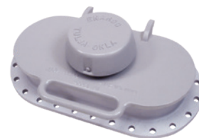
A dead weight, oblong-shaped thief hatch

Emerson’s tight-sealing storage tank solutions can help you meet your Quad O compliance challenges.