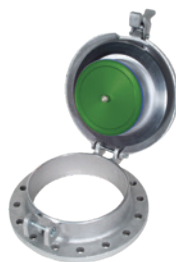
Thief Hatch High-Performance Model ES-665