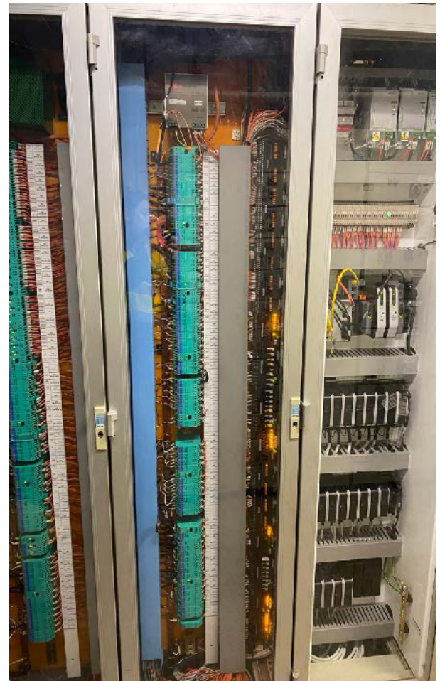
(After) The replacement allows the flexibility to make changes and the enhancement of remote access helped the operators to diagnose the plant state more promptly.

https://www.Emerson.com/documents/automation/brochure-project-certainty-capital-project-success-ebook-emerson-en-6546586.pdf