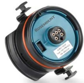
Rosemount 628 Wireless Electrochemical Gas Sensor

Deploying a system of this sophistication, without any cabling beyond the local solar collector and field alarm station, enabled the facility to carry out the installation with a far lower cost and much faster implementation than would be imaginable using conventional methods. Connecting the Rosemount 928 transmitter directly to the field alarm station fulfilled the critical alarming functionality with a minimum amount of cost and effort.