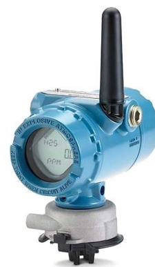
Rosemount 928 Wireless Gas Monitor

Combining Rosemount 928 Wireless Gas Monitors with Rosemount 628 Wireless Electrochemical Gas Sensors enabled four locations with 13 detectors to be monitored without adding any signal or power cabling.