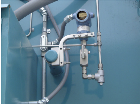
Rosemount™ 3051T Pressure Transmitter with Inline Manifold measuring absolute pressure.