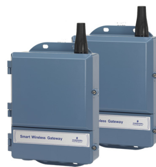
Rosemount Smart Wireless Gateway 1420.

http://www2.emersonprocess.com/en-US/brands/csistechnologies/vt/csi9420/Pages/CSI9420WirelessVibrationTransmitter.aspx