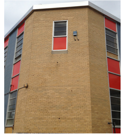
Wireless transmitters communicate to a Smart Wireless gateway 300 feet and more through reinforced concrete and glass.

Although the odor control tower is 200 yards past the solids room, over 1000 yards from the gateway, the new instruments joined seamlessly. On-line monitoring gives early warning of bearing wear, giving readings once per hour instead of once every 3-6 months. It also eliminates the time required to plan and take manual readings. “PeakVue is great” said Helfer. “We have a lubrication and oil program that requires us to constantly check to see if bearings are lubed properly. We now use PeakVue to indicate when to lubricate the bearings on our centrifuges and fan motors.”