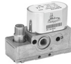
The ED02 series electronically actuated proportional valves from AVENTICS pneumatically control the MU1-RGS series pressure regulators.

Engineer and Head of System Planning & Engineering at Attraktion!