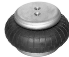
Pneumatic BCP bellows cylinders provide seat movement in sync with the image and sound.