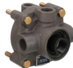
MU1-RGS high-flow pressure regulator from AVENTICS.