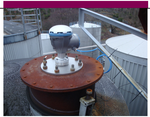
The Rosemount 5900S Radar Level Gauge.

The Rosemount 5900S Radar Level Gauge with its 0.5 mm instrument accuracy was selected as the level measurement device. Depending on the tank, parabolic and horn antennas were used. They both have a condensation resistant design, and a test in one of the plant's tanks during the winter proved that they functioned very well even under the most severe conditions.