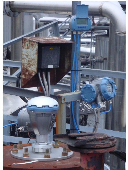
The Rosemount Tank Gauging System on Tank TK52.4.

“I could not think of a better solution than the Rosemount Tank Gauging System”