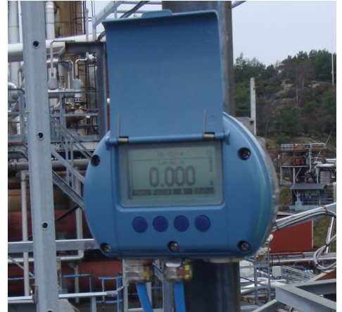
The Rosemount 2230 Graphical Field Display.