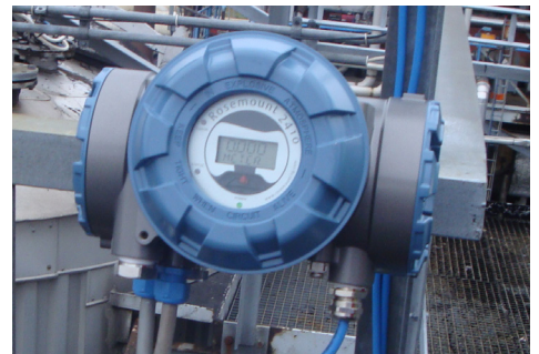
The Rosemount 2410 Tank Hub.