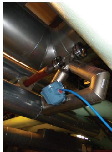
Installation of Micro Motion ELITE® Coriolis flowmeter in application

Doosan Škoda Power selected Micro Motion® Coriolis flow technology because of its high accuracy and direct mass flow measurement. This solution provided precise steam temperature control which allows running the critical performance tests with very low uncertainties. Because the thermal balancing and efficiency calculations are based on mass there was a distinct advantage in using a direct mass flow measurement device versus a volumetric measurement device which required pressure, temperature and compressibility (P,T,Z) correction.