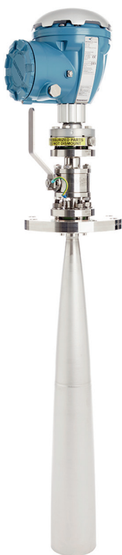
Figure 3. Rosemount 5900S Radar Level Gauge with LNG antenna

temperature and density profiles to detect stratification. This occurs when two separate layers of LNG are formed within a tank and can potentially lead to a dangerous condition called 'roll-over', which can result in an instantaneous release of boil-off vapour.