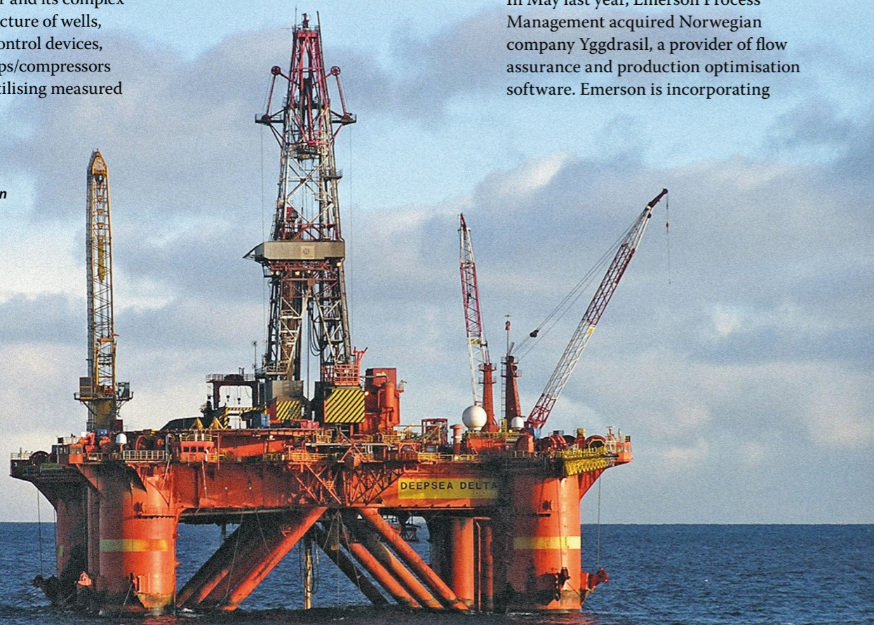
The production management software was used for planning on the Shtokman field.

The software's calculation speed is high and scales linearly. Depending on field complexity, LOF simulation times are typically measured in minutes. Using