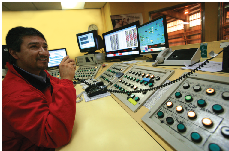
PCs running condition monitoring software are usually located in the mine's central control room and typically connected to the mine's automation system.

The mine's automation system will include some type of human-machine interface (HMI), which normally consists of a number of PCs and monitors that present graphical representations of mine operation to operators and engineers. The HMI