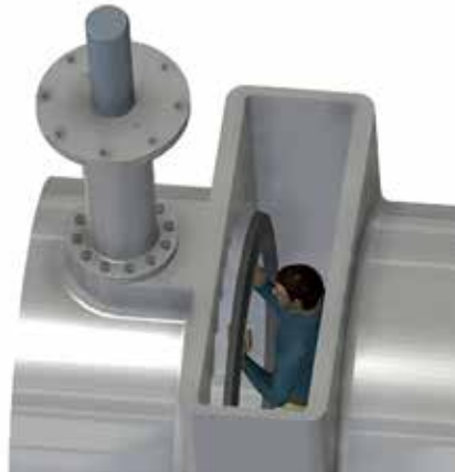
Figure 6 Risk of operator crushing during maintenance of large side entry butt-weld TOVs

Ultimately, the operator will not be able to dry up valve cavities or to address operability problems which are common during LNG plant/terminal start-up