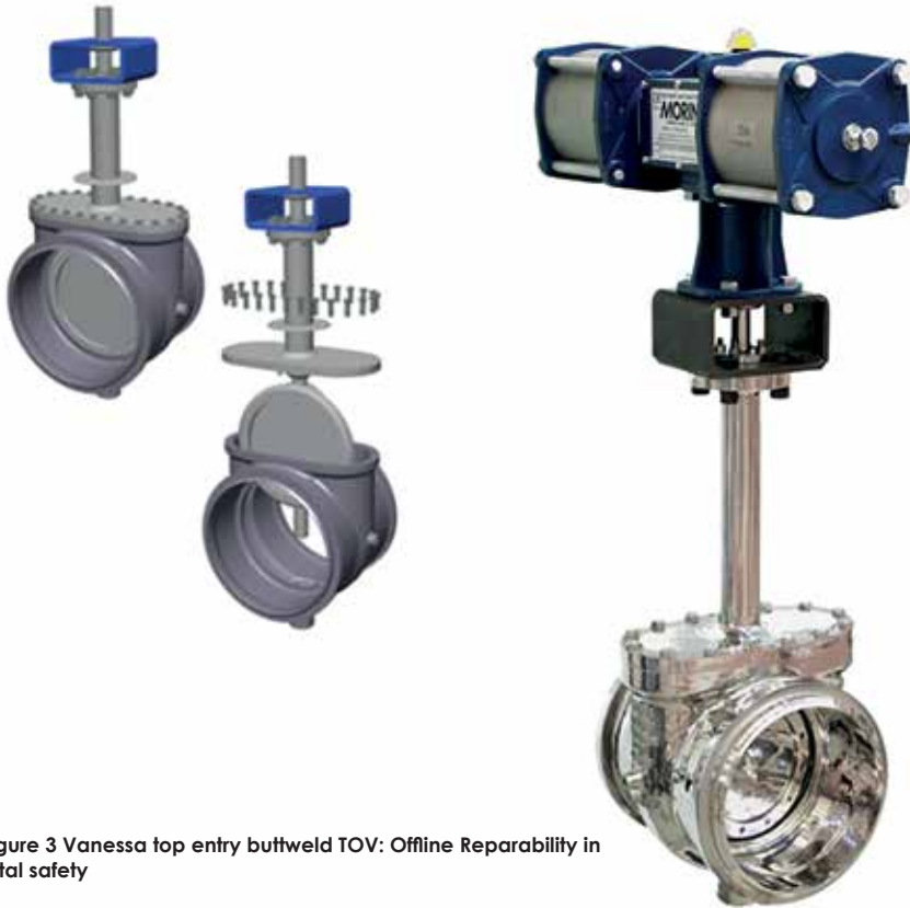
Figure 3 Vanessa top entry butt-weld TOV: Offline Reparability in total safety

Whenever inline access is mandatory, similarly to a top entry ball valve, the top entry butt-weld TOV allows for all possible extraordinary repairs via complete removal of internal components. It is safe to claim that on a clean LNG service maintenance requirements are unnecessary thanks to the 100% metal seating and only extraordinary repairs may become necessary to fix tightness and operability-related issues. Emerson's Vanessa triple offset valve experience shows that in such a compact body, the top flange is also minimally affected by pipe loads.