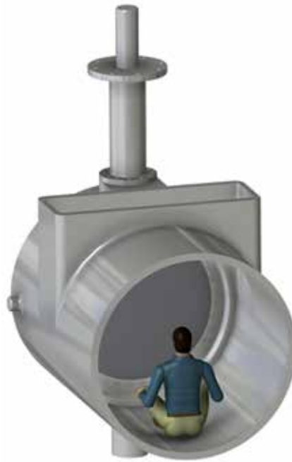
Figure 5 Maintenance of large-sized side entry Butt-weld TOVs: A risky task

A less evident aspect to consider is the fact that any components to be installed on the seat/disc are offset in comparison to the side entry port where they enter the body and it is impossible to put them in/out of place by using the crane alone. The higher the diameter/