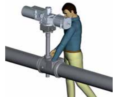
Figure 4 Maintenance of small-sized side entry butt-weld TOVs: An unfeasible task

On clean liquid/gaseous cryogenic applications, some TOVs are virtually maintenance free and do not require any specific maintenance programs. To do so, cryogenic TOVs must be able to guarantee the same performance irrespective of body style designs. Typically, this is linked to the valve trim components operating at temperatures down to -254\text{ }^{\circ}\text{C} ( -425\text{ }^{\circ}\text{F} ).